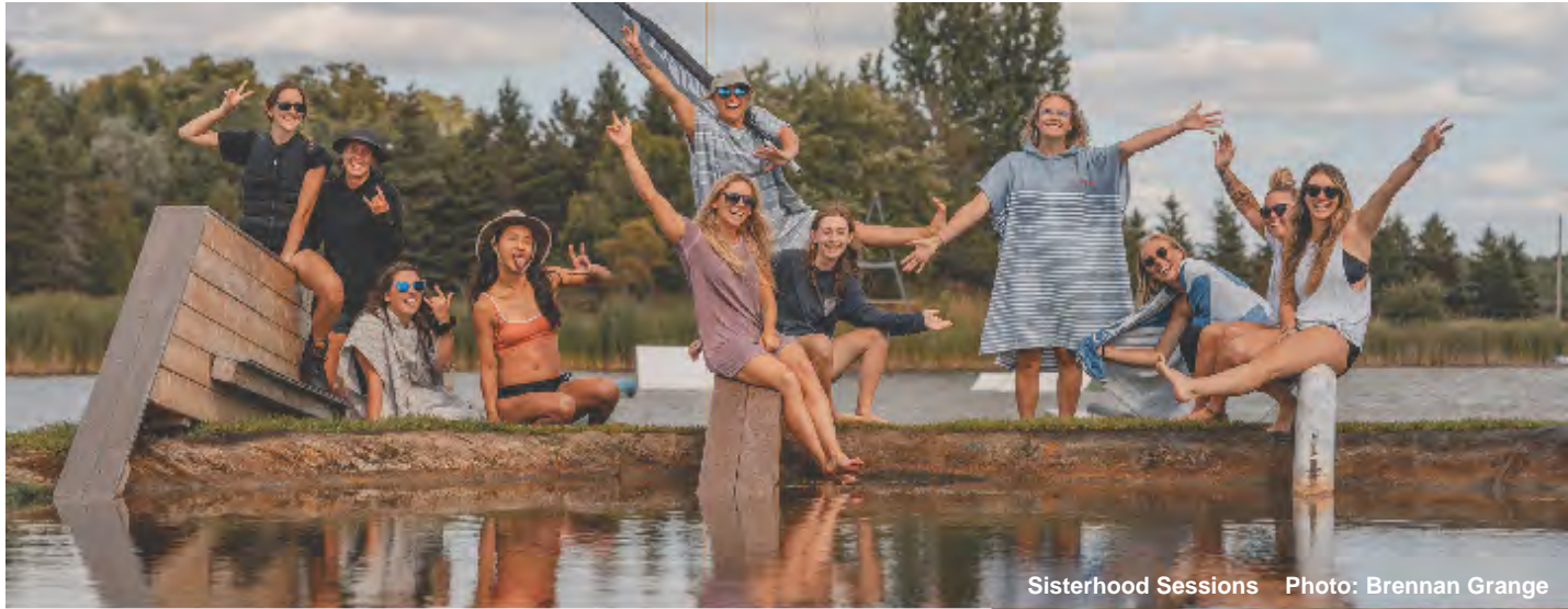
Sisterhood Sessions