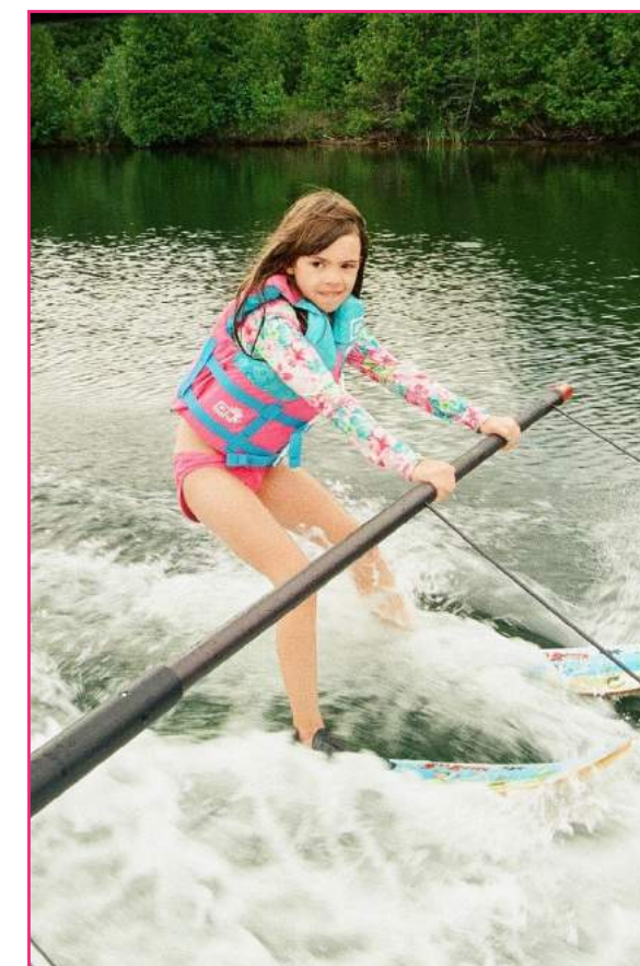
The youngest participant, at 7 years old, had the greatest style points and made all the way down the lake on the boom.

Funds were generously offered from the Ontario government through Water Ski Wakeboard Ontario to help defray the costs of the experience. With this funding the skiers had a great launch into the sport. The lake was essentially shut down for the camp, so that play could happen between skiing adventures. We felt that it was important to try and include children in our program, but in a way that was fun and separate from the membership. Most of our membership don't see the fun in trying to catch fish with a stick between sets!