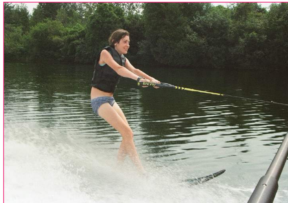
The oldest participant transitioned though skiing with two skis and could get up briefly on one. We know that her water skiing career will be bright!

Each participant had rapid skills development and completed up to 4 "sets" per day.