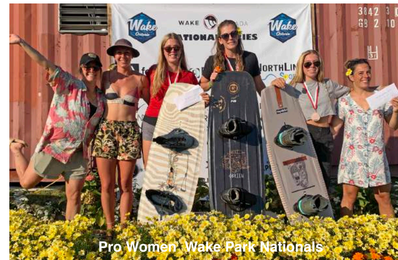
Pro Women Wake Park Nationals