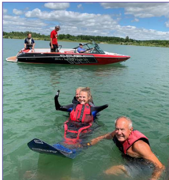
WAKES /// Making a Splash