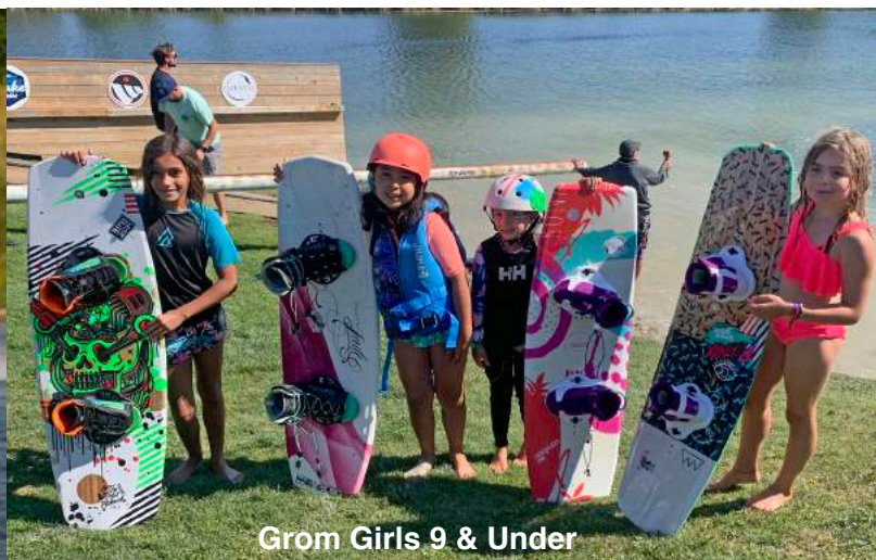
Grom Girls 9 & Under