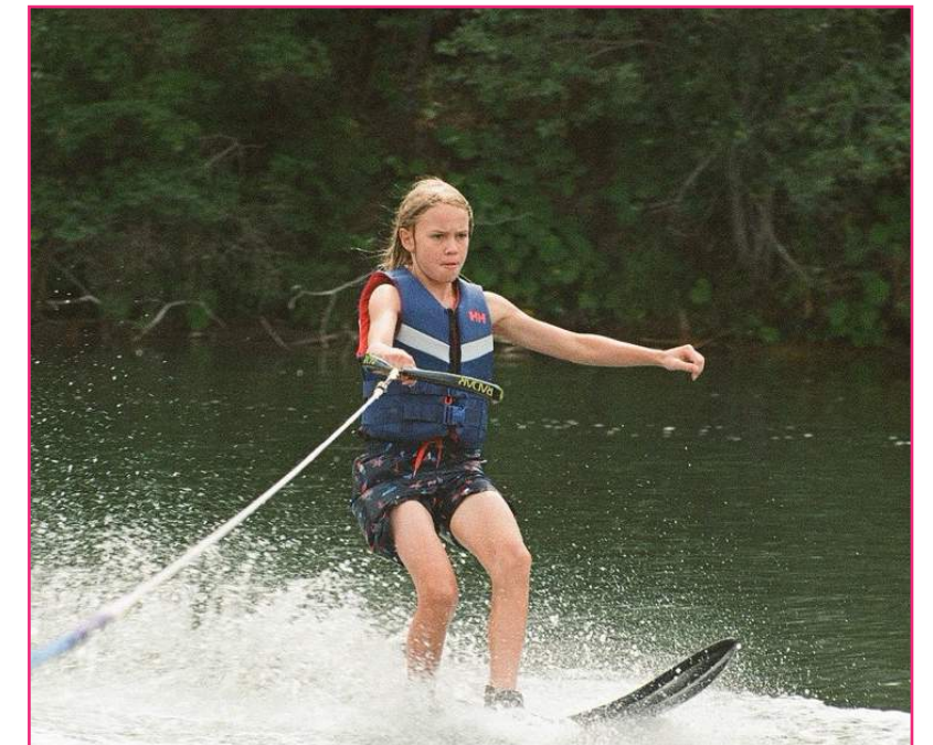
At the end of three days we had one participant skiing loops around the lake on one ski, hanging on with one hand at the corners. He had long left the other ski behind. We are not sure where he will end up as he also likes racing bikes.